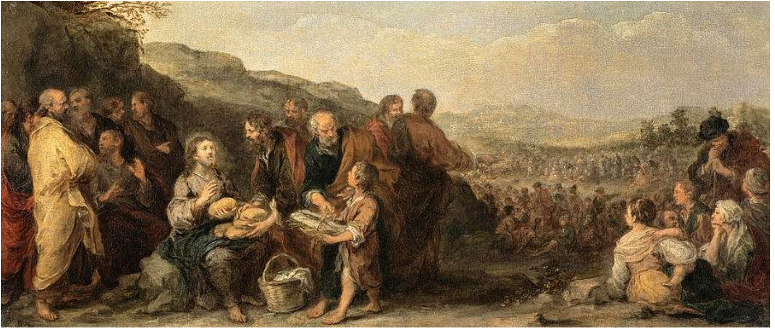
The Miracle of the Loaves and the Fishes, 1682 painting by Bartolome Esteban Murillo

The miracle of the loaves and fishes, recounted in all four Gospels, defies human comprehension. Five loaves and two fish feeding five thousand people is impossible by any earthly standard. Yet, Jesus accomplished this extraordinary feat.