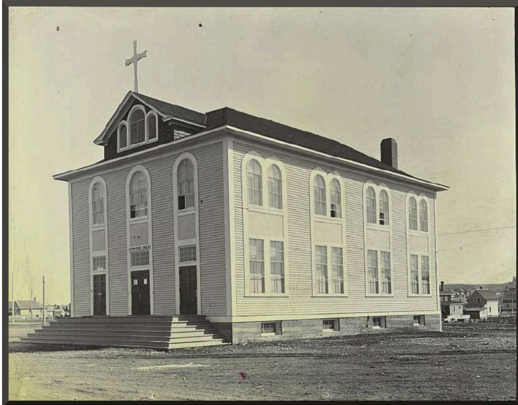
Original Church - 1910